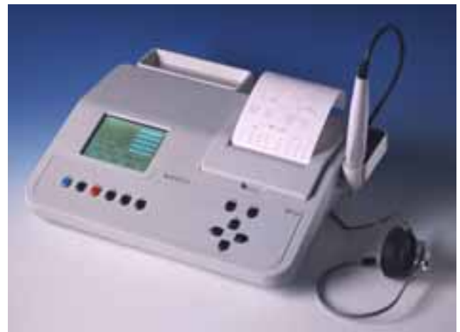
MI 34 with Screening Probe and Options TDH 39- Contra phone and connector cover